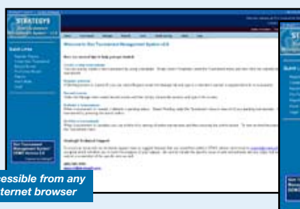
Accessible from any Internet browser

STMS is built from the ground up on Microsoft architecture , delivering tremendous business value through easy integration with third-party applications and services.